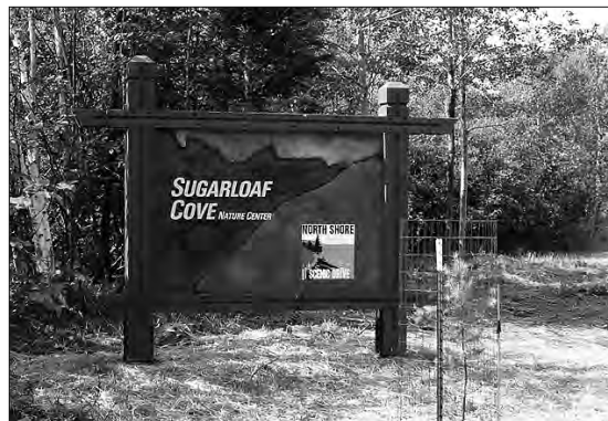
New entrance sign at Sugarloaf Cove

Unfortunately, our sign is 100 feet from the road due to Minnesota Department of