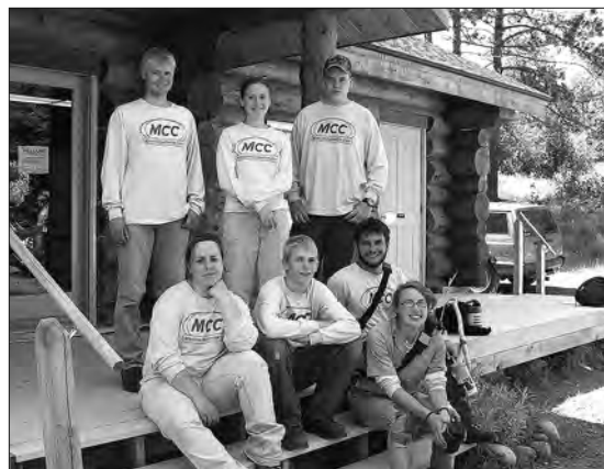
One of the MCC crews that placed gravel along our trail.

Transportation (MNDOT) right-of-way restrictions. As noted by many visitors, the sign is not visible from Highway 61. Sugarloaf is working with MNDOT to find a way to have the sign moved closer to the road, hopefully by next summer.